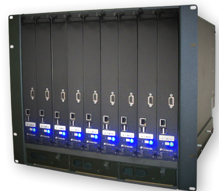
The Cirrascale MBC-XM Modular Blade Chassis